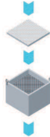
Particle filter H13 with 10% active carbon foam