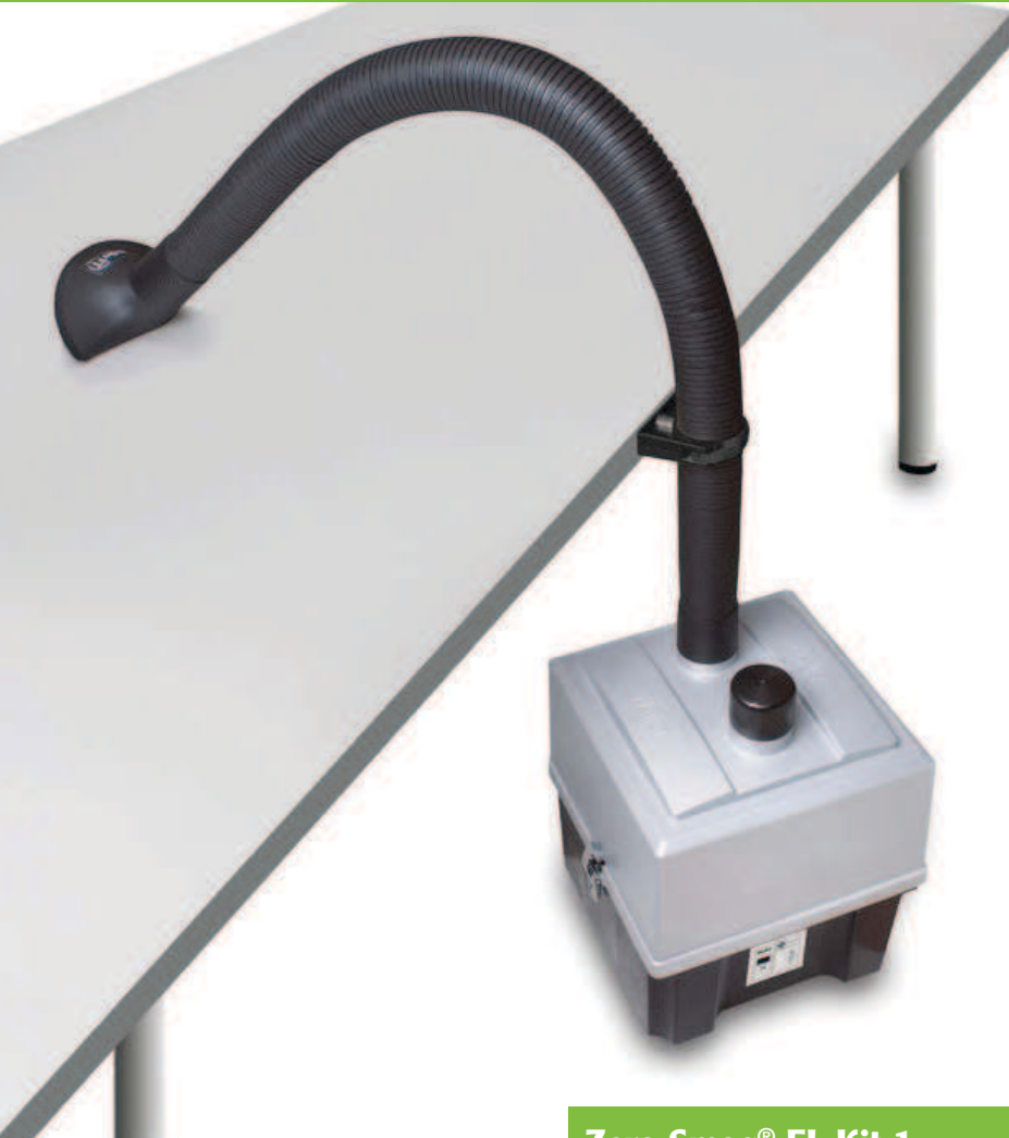
M5 medium dust pre-filter